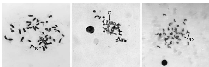
Figure 1: Metaphase plate mouse bone marrow cells: A: Single fragment ( \times 1000 ); B: Gap ( \times 1000 ); C: Paired fragments ( \times 800 ); D: Exchanges ( \times 800 ).

The administration of the studied medication to animals did not cause an increase in the proportion of bone marrow cells with chromosomal abnormalities (Figure 1). According to the data obtained, the proportion of the cells with chromosome aberrations in animals of the experimental group III did not differ significantly from the negative control mice (Table 1). The frequency of the cells with chromosome abnormalities in animals after a single injection of the medication at a 7-fold therapeutic dose also did not have statistically significant differences relative to the negative control group. These findings were as consistent with the studies of Istifli and Topaktaş (2010), where amoxicillin in human lymphocyte cell culture even at high doses (1 mg/ml) did not induce cytogenetic instability determined by the methods of accounting for chromosome aberrations, sister chromatid exchanges and micronuclei.