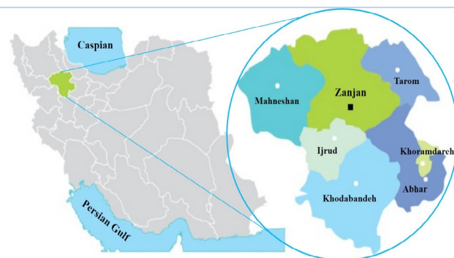
Figure 2: Map of study area indicating the location of site where Siahmazgi cheeses were collected.

Totally 76 Siahmazgi cheese samples were collected randomly from different regions of Zanzan province-Iran during the years of 2017 to 2018 (Figure 2). The method of choosing a sampling place was based on the highest level of factories and the highest amount of cheese production. According to the Institute of Standards and Industrial Research of Iran (ISIRI) NO.326, at least 100 g of each sample were collected in sterile bag (Persian ZipKeep Co., Tehran, Iran) and kept under adequate refrigeration condition (1-5 °C) until analysis (ISIRI, 2009b). Each sample was divided to microbiological and chemical analyses. All the experiments were carried out in triplicate (Nespolo & Brandelli, 2012).