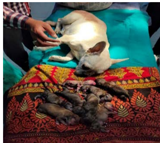
Figure 4: Delivered Fetuses after caesarean section