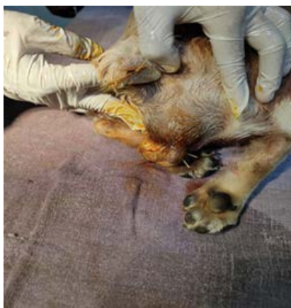
Figure 2: Horizontal mattress suture using nylon with tubing on both lateral side of vulva