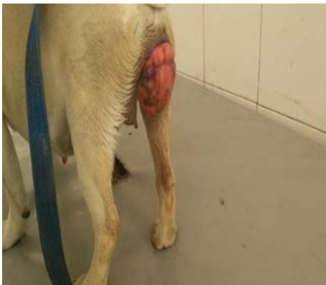
Figure 1: Prolapse mass at 52 nd day after mating

done by using nylon suture with a horizontal suture pattern with tubing done on both lateral walls of the vulva (Figure 2). Nine days later sutures were removed. Two days later after removal of suture, prolapsed mass again came out. At 62 nd day of pregnancy animal treated with DNS 25% (100 ml) i/v, Ca sandoze 5 ml i/v, oxytocin 5 I.U. i/v. the Animal was taking straining but unable to deliver fetuses (Figure 3). Because of the re-occurrence of prolapse mass, the owner was advised for ovariohysterectomy of the bitch but the owner did not agree for ovariohysterectomy. Therefore, cesarean section was performed by midline incision 1 inch behind the umbilicus ventrally. An Incision in large curvature of the uterine horn was applied separately in each horn, 9 fetuses were removed (8 live and 1 dead) (Figure 4). Suturing of uterus done with the polygalactin 910 suture no.1 with lambert followed by cushioning suture pattern. After closing peritoneum, muscle and skin, that prolapsed mass was washed with normal saline and lignocaine jelly applied to the prolapsed mass than prolapsed mass was repositioned and vulva was sutured in horizontal mattress suture pattern using nylon. Post-operative treatment was done with cefotaxime 250 mg bid, meloxicam 0.4ml, pheniramine maleate 1 ml, vitamin B complex 2ml along with fluid therapy DNS 5% (100 ml) and metronidazole 30 ml for 5 days.