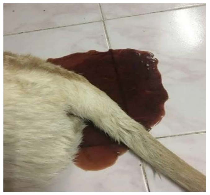
Figure 1: Bloody Diarrhea

asanorexia, depression, fever and weakness (Gerlach et al., 2020). Later on, typical signs such asvomiting and watery bloody diarrhea are repoted. Due to a large amount of protein(s) and fluid loss from gastrointestinal tract, dehydration and hypovolemic shock often develop quickly (Goddard and Leisewitz, 2010). This disease is usually occurring in non-vaccinated dogs due to unawareness of owner, high cost of vaccines and poor insecurity practice. The constant presence of the pathogen at a particular area becomes endemic.